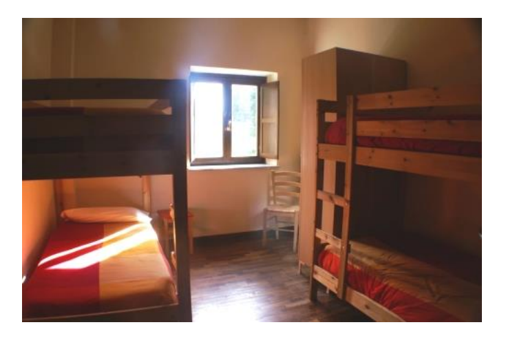
One of the bunk rooms at Rifugio Marini

Overnight Rifugio Marini. This 18 room refugio offers simple accommodation, with mainly bunk rooms and some twin rooms.