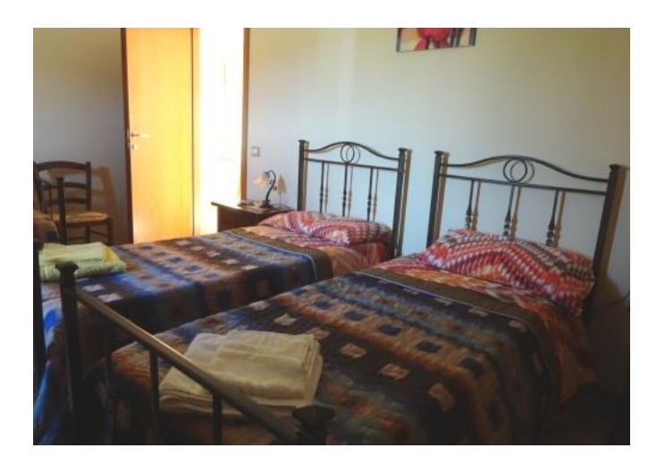
A twin room at Casa Il Bosco