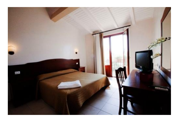
One of the bedrooms at Torre di Renda